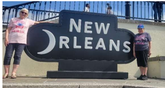
Right: PSC Ball Cap joined some cool kids in