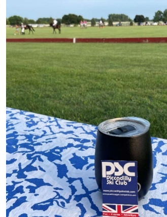
Right: Piccadilly Business Card sipped wine and watched Polo at Arranmore Farms