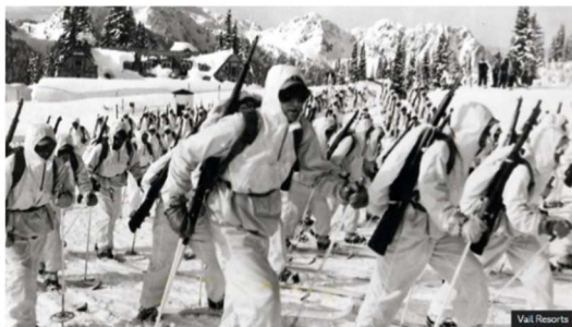
The unit played a very important role in a battle against Nazi forces in Italy

Skis themselves underwent many improvements. Rudolph Lettner from Austria created the steel edge in 1928 giving skiers a better grip on hard snow. Now a better carved edge could be achieved. Unfortunately, it was held on by screws which frequently fell out. The skier had to carry extra screws, a screwdriver, and sometimes an extra edge to replace when their edge fell off.