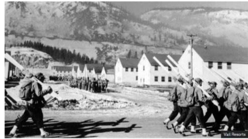
The 10th Mountain Division was created by the US War Department to help prevent a Nazi invasion and trained outside Vail

1936 also saw the installation of the first chairlift in Sun Valley, Idaho – built at the Union Pacific railroad shops in Council Bluffs IA. Lift devices such as rope tows and later gondolas were soon seen in many major ski areas making multiple times down the hill much easier.