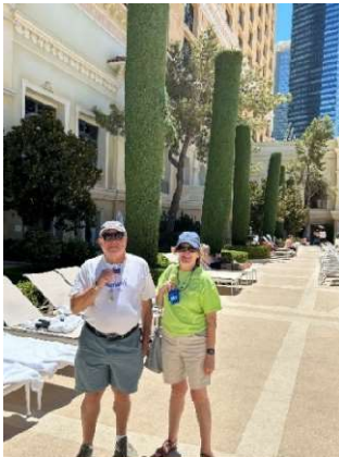
Left: PSC Business Card and Plastic Beach Wallet gambled away all their ski money, then hung out at the Bellagio pool in beautiful Las Vegas. Al & Cindy S drove the getaway car.